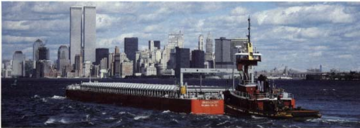
The bulk barge BRIDGEPORT crosses New York Harbor's upper bay on the way to the East River and Long Island Sound.

The latest new-building for the Moran fleet is the dry bulk carrier, 474,924 cubic foot cargo capacity, barge BRIDGEPORT . Designed by Moran's Construction and Repair Department, BRIDGEPORT was launched in June of this year from the McDermott Shipyard, Morgan City, Louisiana, a firm that has built many other vessels now sailing in the Moran fleet.