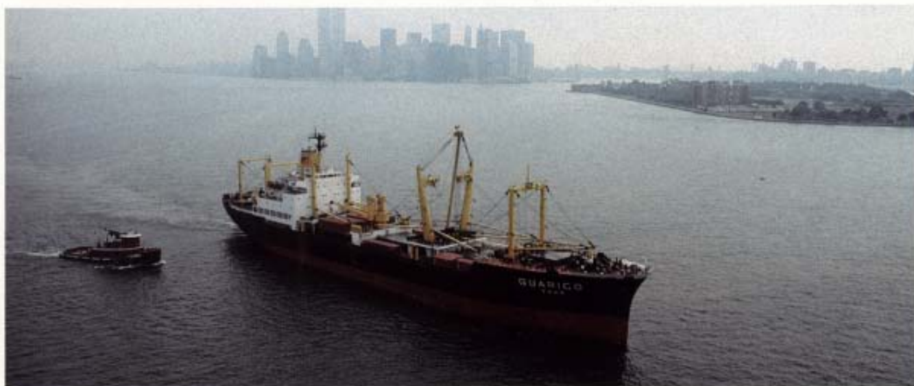
C.V. GUARICO - Compania Anonima Venezolana de Navegacion, Venezuela, July 1986.