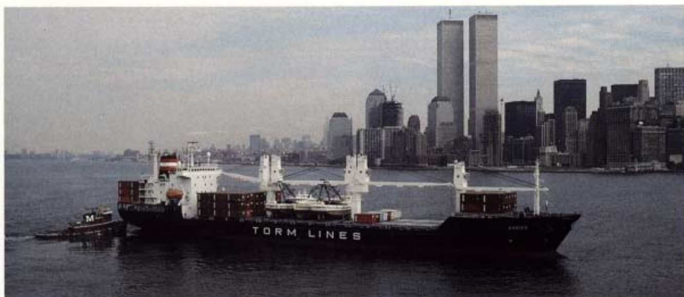
C.V. VODICE - Torm Line, Norway, Maiden Arrival October 17, 1986