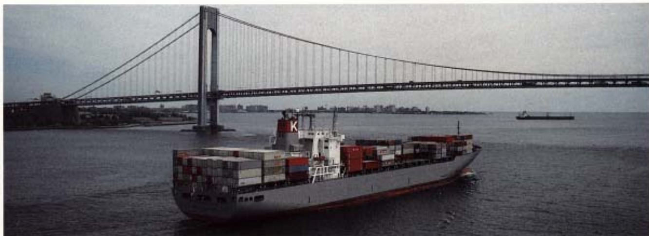
C.V. GEORGE WASHINGTON BRIDGE - Kawasaki Kisen KK (K-Line), Japan, Maiden Arrival August 1986.