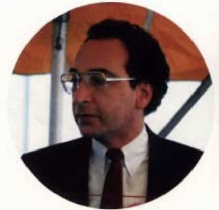
Mayor Thomas W. Bucci