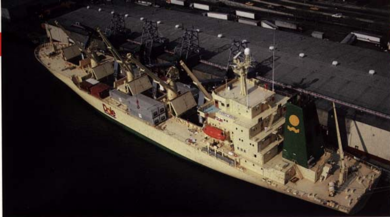
M.V. TROPICAL MORN - Castle & Cook, Honolulu, Hawaii, Maiden Arrival November 12, 1986