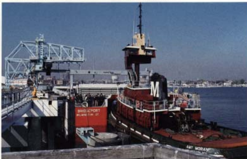
The AMY MORAN positions the barge BRIDGEPORT under the automatic unloader at United Illuminating Company's Bridgeport Harbor Station.

The smaller barge also makes it possible to bypass the longer trip around Long Island and sail directly through New York Harbor and the East