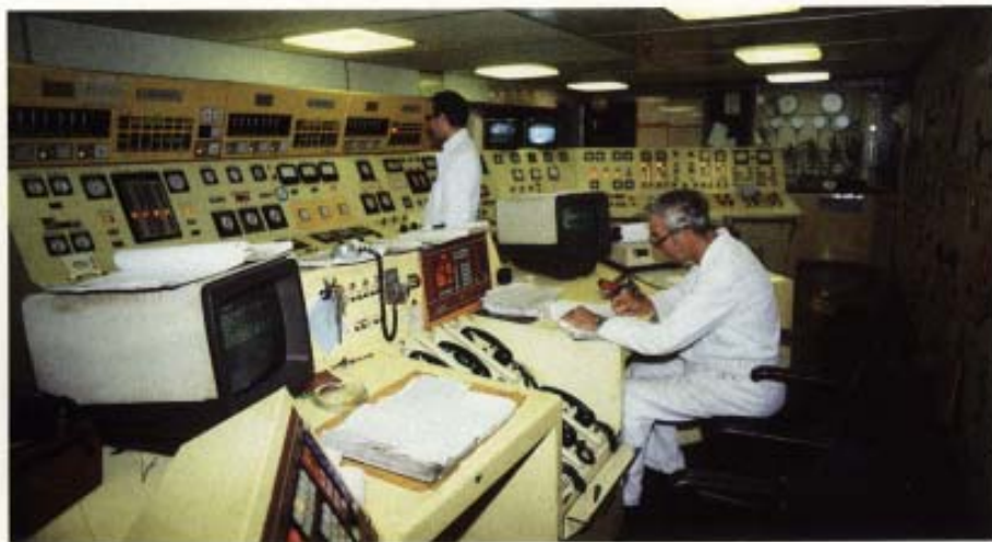
The boiler control room of the QE2 will be removed as part of the reengining to a diesel electric propulsion plant.

When the QE2 was launched in 1969 she cost $80 million, but Cunard hopes that the reinvestment in the rebuilding will add twenty years to the life of the ship. There is even a rumor that with her new engines QE2 might try and recapture the famed "Blue Riband" for the fastest crossing of the Atlantic, an award now held by the S/S UNITED STATES . Moran looks forward to welcoming back the QUEEN when she returns to New York on Monday, May 4th, 1987 as the M/V QUEEN ELIZABETH 2 .