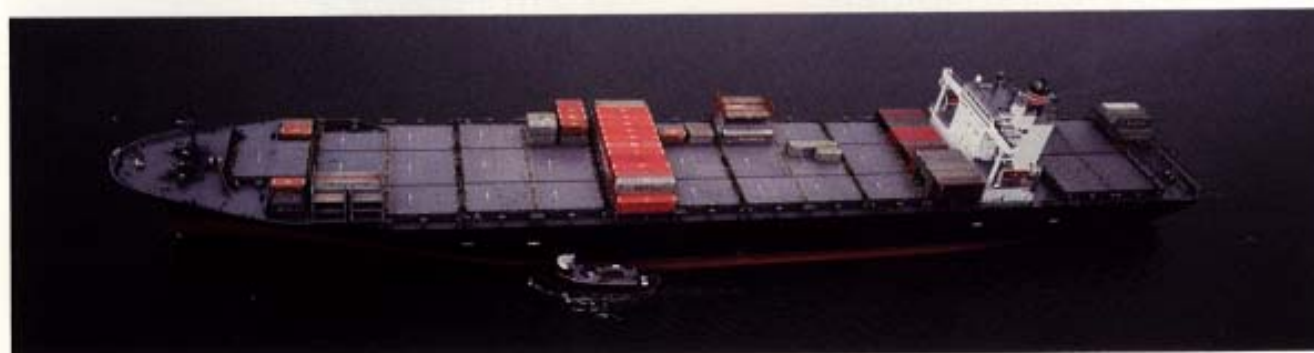
C.V. CAPE CHARLES - Nippon Yusen Kaisha (NYK) Maiden Arrival November 1986