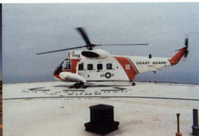
HH-52A SIKORSKY SEA GUARD

Next to sea gulls, one of the most common sights in the skies over the nation's waterfronts is the U.S. Coast Guard's HH-52A Sikorsky Sea Guard helicopters, in service since the 1960's. Many mariners owe their lives to the quick response of these